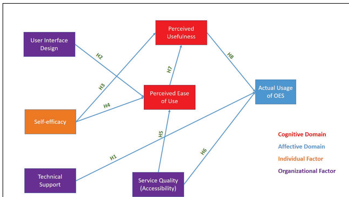
Figure 1. Proposed Structure Model for the Usage Predictor Factors of OEAS.

As a result of these hypotheses based on related literature, Figure 1 shows the proposed structural model for analyzing the predictors of actual usage of online student evaluation and assessment systems.