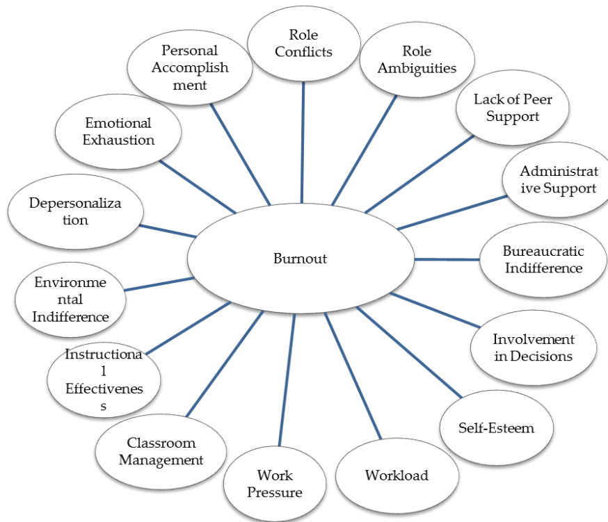
Figure 2: Factors in Teacher Burnout

The participants' responses to the open-ended question yielded different factors and dimensions, which can be expressed as follows in Figure 2: